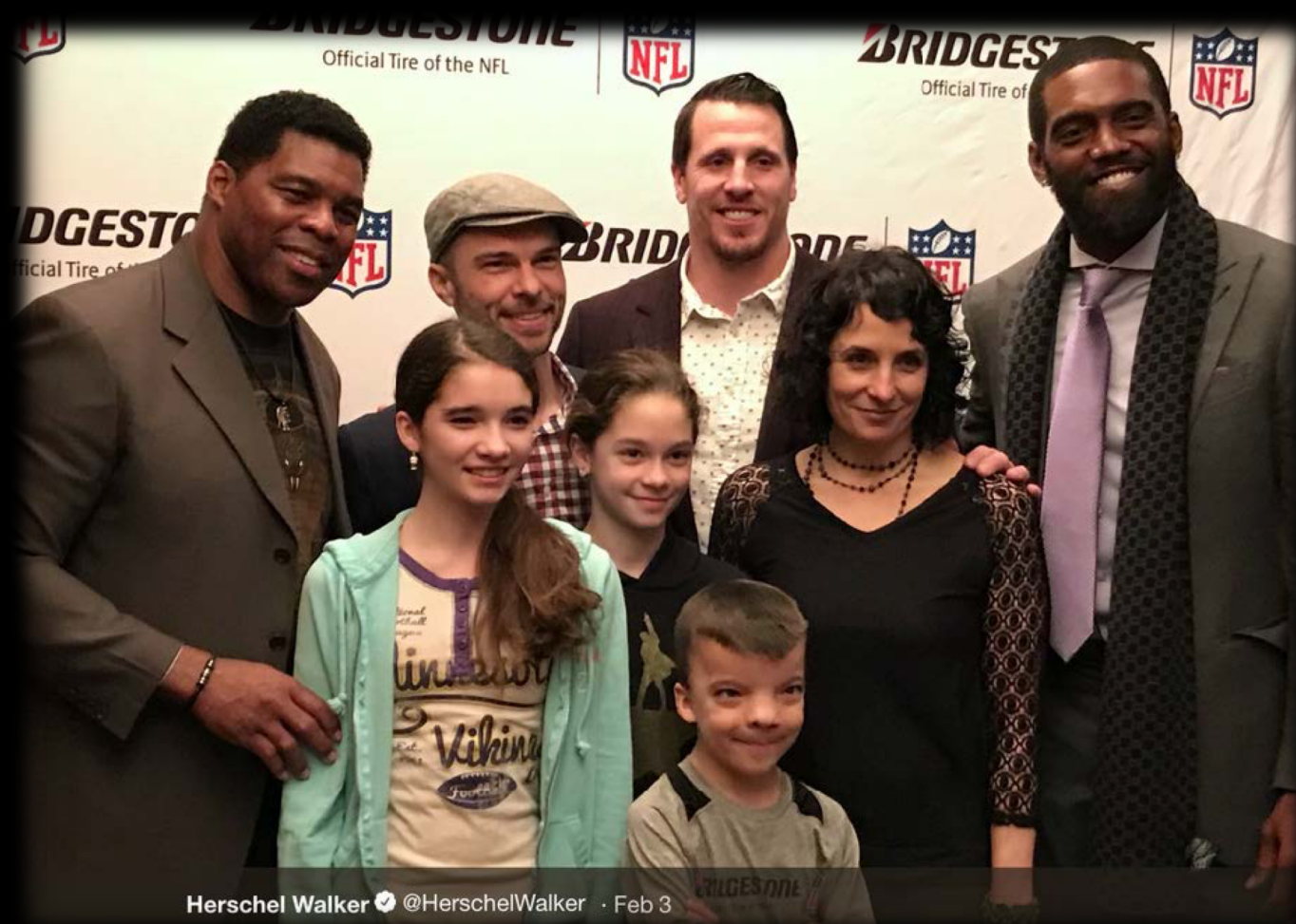
Herschel Walker 📍 @HerschelWalker · Feb 3